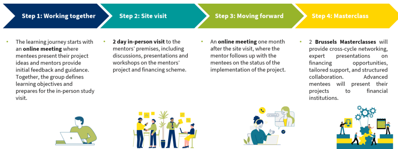
Figure 3: Steps of the PROSPECT peer learning programme

The PROSPECT Peer-learning programme is designed to enable deeper learning, based on mentees' learning needs and practical project examples. Mentees will learn more about how the financing scheme or enabling structure was implemented by the mentor, including technical and governance aspects, and will get hands-on advice on how to move on with their own local projects. They will also have the possibility to access further educational resources, learning materials and tools.